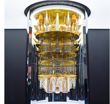
Figure 1: Quantum Computer.

Syllabus: Extended introduction and overview of the field; linear algebra fundamentals; postulates of quantum mechanics; quantum circuits and gates; entanglement, teleportation and Bell's inequality; quantum computation, algorithms and complexity classes; introduction to Qiskit programming; introduction to quantum error-correcting codes; quantum data compression (Von Neumann entropy); quantum communications (as time-permits).